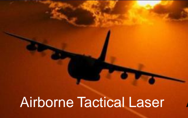
Airborne Tactical Laser