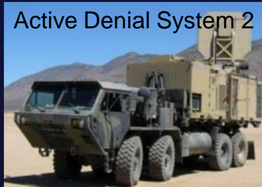
Active Denial System 2