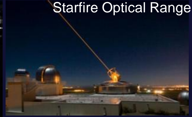
Starfire Optical Range