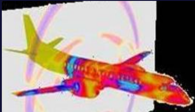
Modeling, Simulation, and Effects